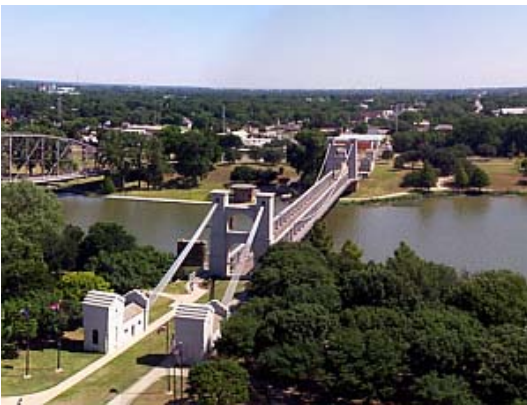
Amateur Television in action: View from the HOTARC Skycam

HOTARC has a long history of handling images over the airwaves. We are the first and still the only operating amateur television (fast scan) repeater in central Texas. But we've come a long way, with the help of several veteran operators who have left us a wonderful legacy of equipment and techniques that we still successfully use today. And digital technologies are enabling new developments.