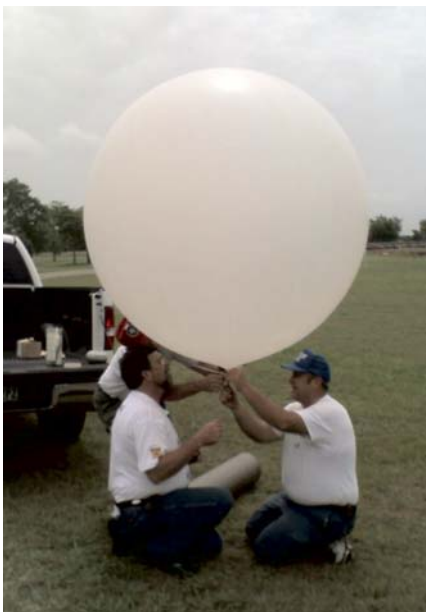
Filling a 6-ft balloon with helium