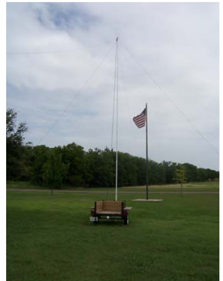
Grab 'n go trailer supporting a 40m dipole

I hope to collect photos from everyone who brought a camera to the park ... PLEASE send them to me!! I will prepare a more thorough report, including our scores and statistics, and photo documentary of Field Day 2007 for our web site and the ARRL soapbox page.