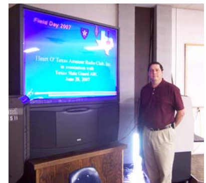
KC5NT summarizes W5ZDN Field Day Scores