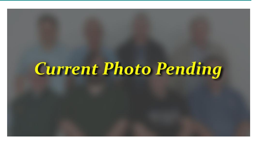
2017 Board of Directors

145.15 MHz (input at -600 kHz, tone 123 Hz) 146.98 MHz (input at -600 kHz, D-Star) 442.875 MHz (input at +5.0 MHz, tone 123 Hz)