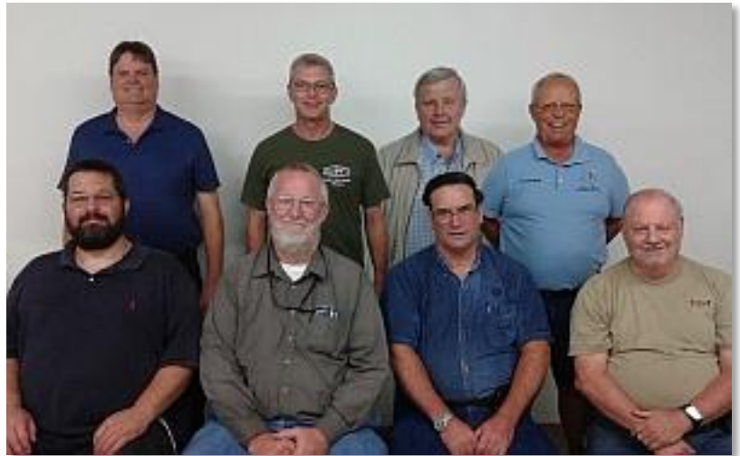
HOTARC 2017 Board of Directors Back: AE5CA, KG5DHS, KD5KJU, KC5KNI Front: KD5DZU, KD5UEW, KB5SLI, AG5HF