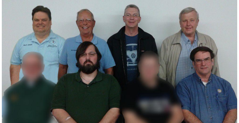
2016 Board of Directors