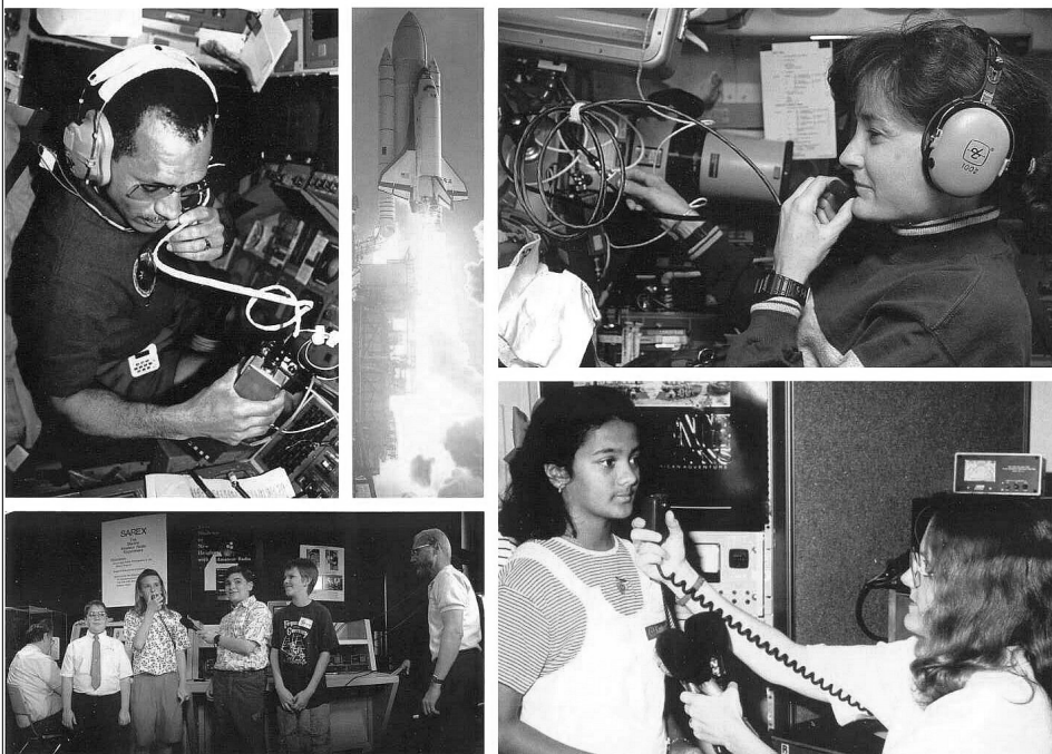
Photo 2: An early NASA promotional poster for the SAREX project.

is to inspire students, worldwide, to pursue careers in science, technology, engineering and math by providing Amateur Radio communications opportunities with the International Space Station (ISS) on-orbit crew. Students learn about life on board the ISS and explore Earth from space through their classroom participation in such things as