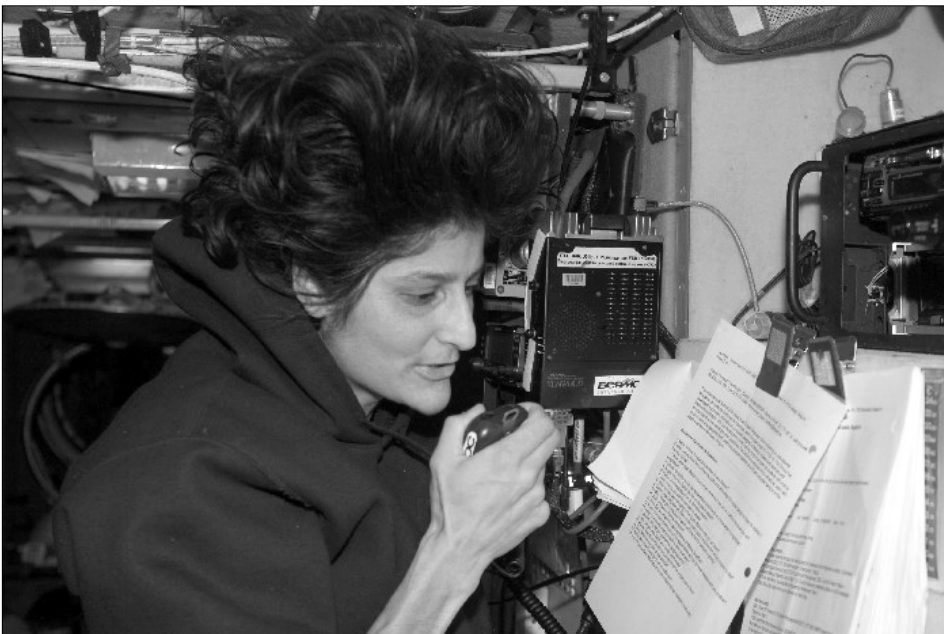
Photo 5: Astronaut Sunita Williams, Expeditions 14 and 15 Flight Engineer, talks with students at the International School of Brussels in Belgium from the ISS's Zvezda Service Module during an ARISS school contact.