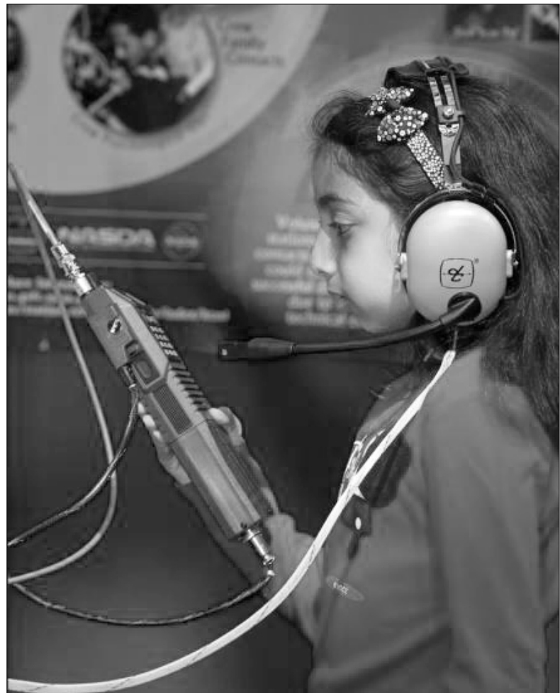
Photo 7: ARISS contacts forever touch the lives of the school students who make them. Here a young girl goes "voice to voice" with a crewmember onboard the ISS during an ARISS school contact.