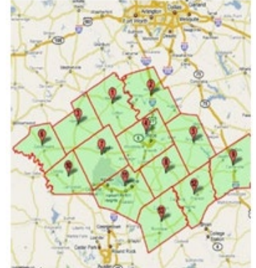
Baker's Dozen counties

If you are interested in becoming a member of McLennan County ARES, go to the HOTARC Web site under the frequently asked questions and download the application.