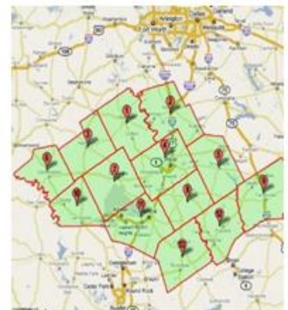
Baker's Dozen counties

If you are interested in becoming a member of McLennan County ARES, go to the HOTARC Web site http://www.hotarc.org/ under the frequently asked questions and download the application. E-mail or mail the completed application according to the instructions listed at the bottom of the application. Your application will be processed and you will receive an ARES ID Card. Check in to the Weekly McLennan County ARES net every Monday at 8:00 PM on the 145.15 repeater (tone 123.0). If you have a sincere desire to help, registration is necessary before the next emergency, not after it occurs. We are also beginning to include our 70 cm repeater 442.875 MHz (input at +5.0 MHz, tone 123 Hz).