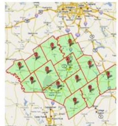
Baker's Dozen counties

If you are interested in becoming a member of McLennan County ARES, go to the HOTARC Web site http://www.hotarc.org/ under the frequently asked questions and download the application. E-mail or mail the completed application according to the instructions listed at the bottom of the application. Your application will be processed and you will receive an ARES ID Card. Check in to the Weekly McLennan County ARES net every Monday at 8:00 PM on the 145.15 repeater (tone 123.0). If you have a sincere desire to help, registration is necessary before the next emergency, not after it occurs. We are also beginning to include our 70 cm repeater 442.875 MHz (input at +5.0 MHz, tone 123 Hz).