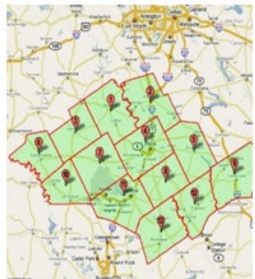
Baker's Dozen counties