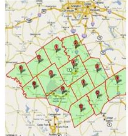
Baker's Dozen counties

If you are interested in becoming a member of McLennan County ARES, go to the HOTARC Web site http://www.hotarc.org/ under the frequently asked questions and download the application. E-mail or mail the completed application according to the instructions listed at the bottom of the application. Your application will be processed and you will receive an ARES ID Card. Check in to the Weekly McLennan County ARES net every Monday at 8:00 PM on the 145.15 repeater (tone 123.0). If you have a sincere desire to help, registration is necessary before the next emergency, not after it occurs. We are also beginning to include our 70 cm repeater 442.875 MHz (input at +5.0 MHz, tone 123 Hz).